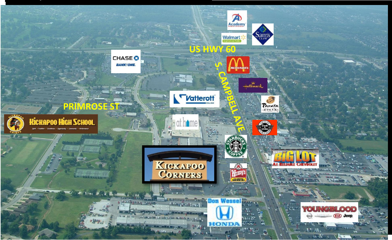
Kickapoo Corners View to the South